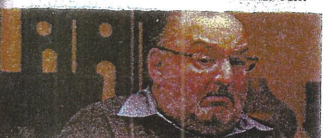
Papou - The Patriarch