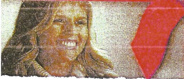
Tiffany - The Wife