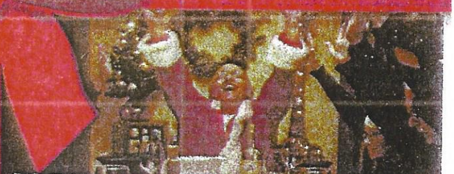
Telly - The Crazy Cousin