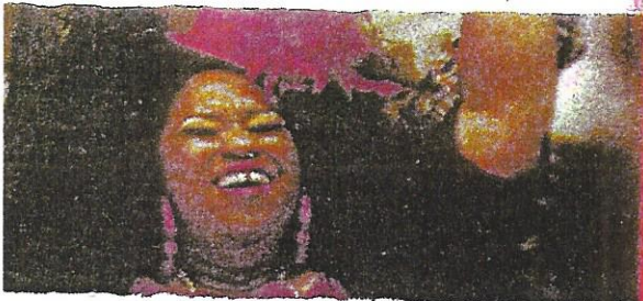
Ithea - The Therapist