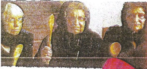
The Grandmothers - Yia Yia Mafia