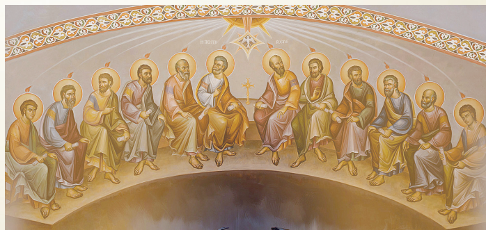
The Holy and Great Council is assembling on the feast of Pentecost.

So, after almost a century, the agenda was finalized, the documents were edited, and the process was completed in January 2016.