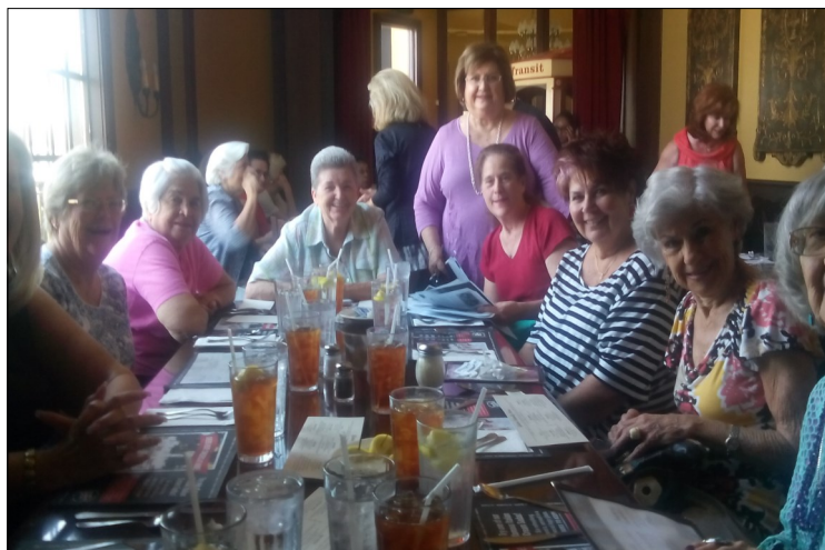
Pictured above are some of the ladies who gathered for the May 16th Philoptochos General Members' Meeting at the Old Spaghetti Factory. The next general meeting will be in September.