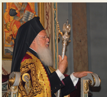
His All-Holiness Bartholomew, Ecumenical Patriarch.

The Orthodox Church is the church of the apostles, the church of the martyrs, the church of the fathers, the church of the councils. Through the centuries, the Orthodox Church convened local and regional, great and greater, as well as universal or ecumenical councils. Just as every celebration of the holy Eucharist is a confirmation of the communion between each person with his or her community, and that local community with the universal Church,