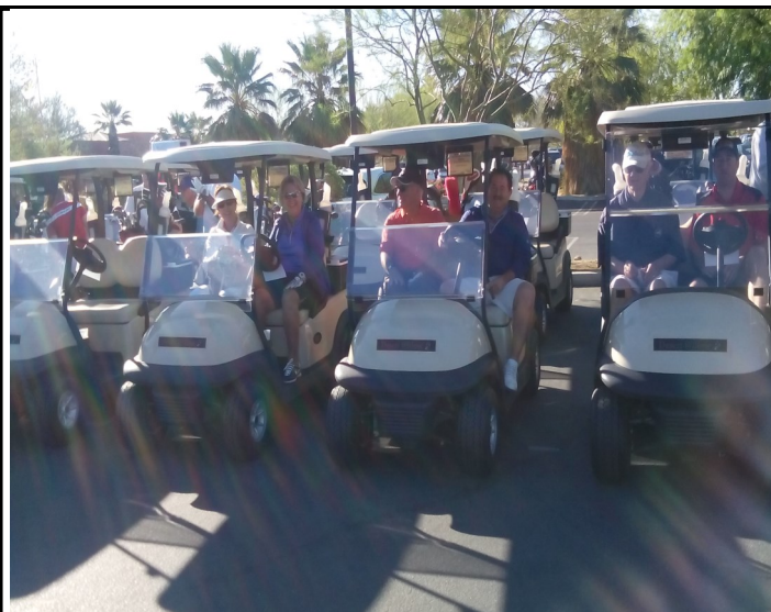
Golf Tournament-Saturday, May 7th at Desert Willow Golf Resort: "Ladies and Gentlemen, start your engines!"