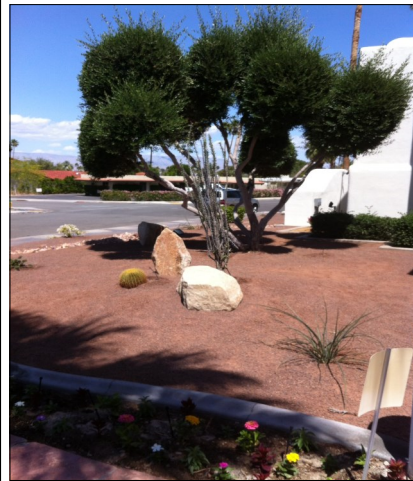
Pictured to the left: The front "yard" of our church property, with the landscaping project completed.