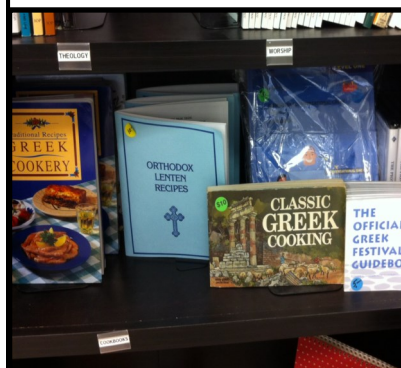
Photo of cook books in our book store.