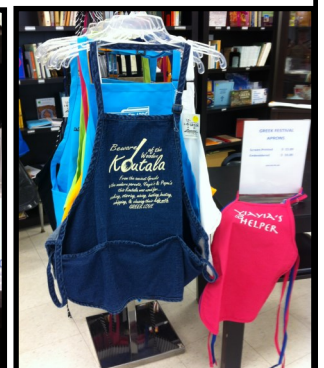
Specialty aprons for a limited time only.