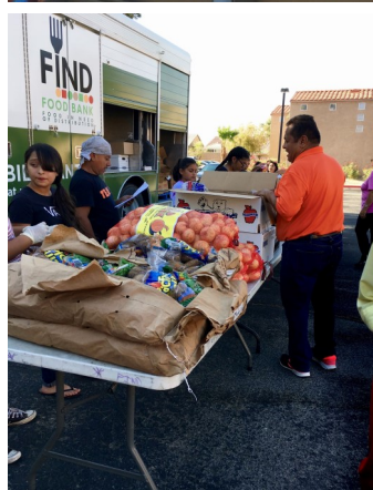
To the left: Community volunteers from the Find Food Bank helping to supply food for the hungry in Palm Springs. $20 can help to feed 4 families. Contributions to the Find Food Bank are always welcome.