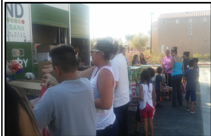
Pictured above: Palm Springs residents gathering needed food from the Find Food Bank of Coachella Valley on Thursday, June 13th.