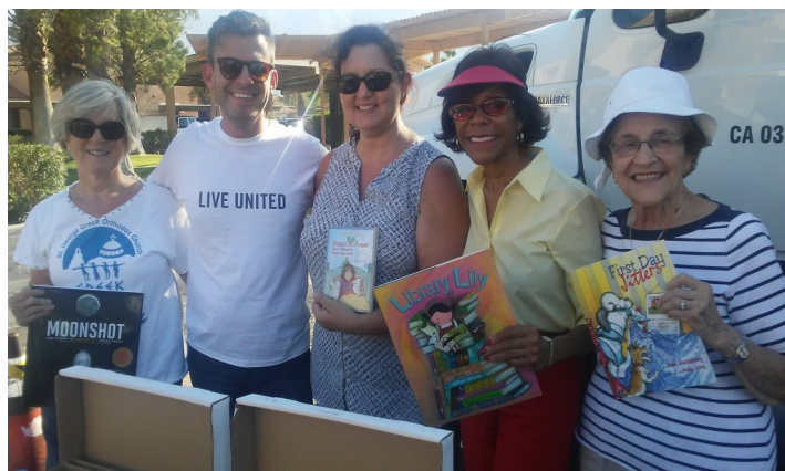
Pictured above: St. George volunteers helping the United Way distribute books to school children in Palm Springs on Thursday, July 13th.