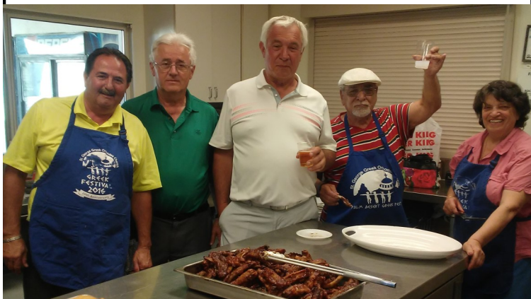
Pictured above are the members of the cooking crew for Friday night's St. George Golf Tournament (April 21). The Friday night dinner was a steak dinner, served with appetizers and cheese cake for dessert.