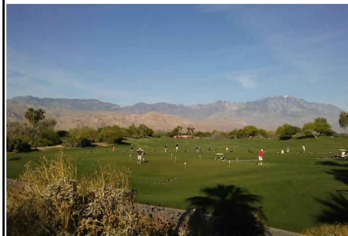
Pictured above are participants practicing before teeing off for the Saturday St. George Golf Tournament at Desert Willow Golf Resort. The format for the tournament on Saturday, April 22nd was a "Scramble Format."