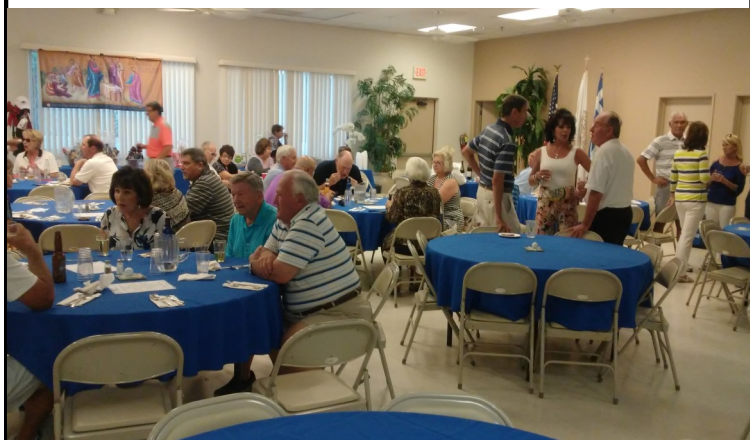
Pictured above are golfers and guests attending the Friday Night Golf Tournament steak dinner. Friday's golf tournament was "stroke play," with tee-off at 12:30 p.m. The golfers showed great perseverance, weathering temperatures near 100 degrees.

Participants in the Friday edition of the St. George Golf Tournament pass by the "Silent Auction" table during the dinner. The Silent Auction featured items for grandparents to give to their grandchildren.