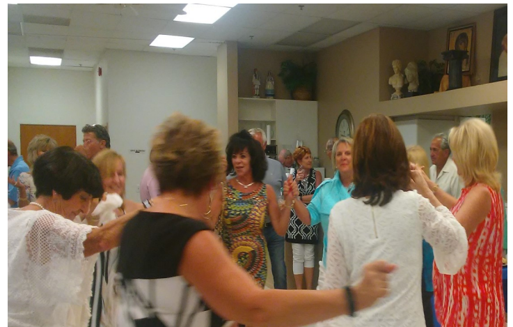
Following the Awards Dinner and Parish Name Day Banquet on Saturday Night, featuring a Greek-Style lamb menu, dancing to live music continued into the night.