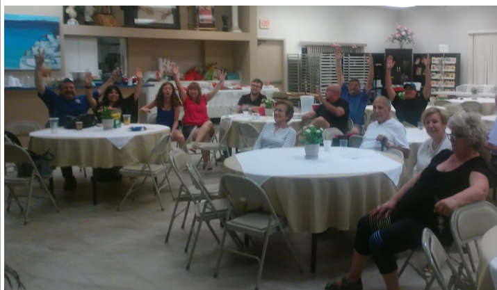
Above: A scene from our 1st Annual AHEPA Super Bowl party on Sunday, February 4th. Proceeds from this Super Bowl party were sent to the Fr. T. P. Theophilos Memorial Scholarship Fund.