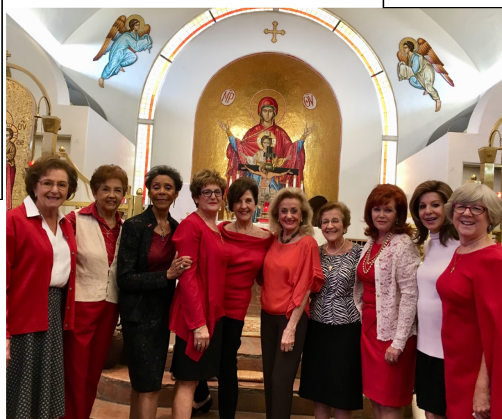
GO RED FOR WOMEN Special Philoptochos Fundraiser Event: Some of the "ladies in red" posed for a group picture

<—At the left: GO RED FOR WOMEN lay-out featuring the baked goods that were for sale. Proceeds from the sale went to Philoptochos charities.