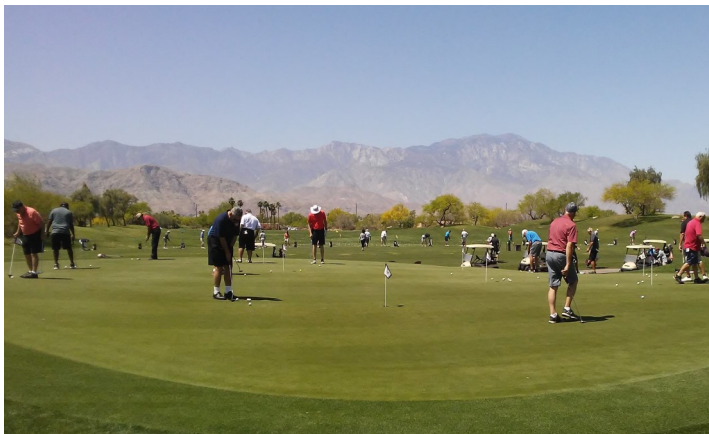
The many golfers who participated in this year's St. George Golf Tournament took time to practice before tee-off. The San Jacinto Mountains grace the background.