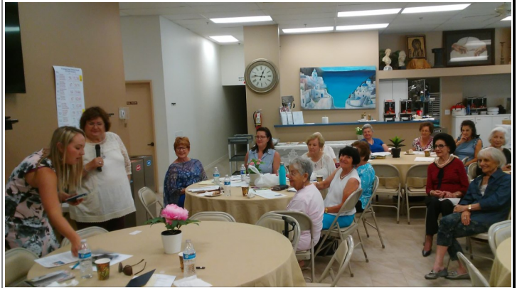
The Philoptochos General Members' Meeting, held on Monday, April 16th, was well attended, as members heard about the work of the local Desert Cancer Foundation.