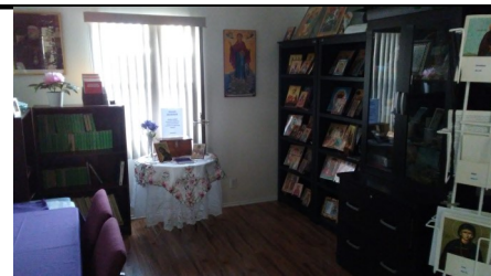
Our parish bookstore now located in Classroom #1.

Our parish bookstore has been newly established in Classroom #1. This classroom serves both as a Sunday School classroom and parish bookstore.