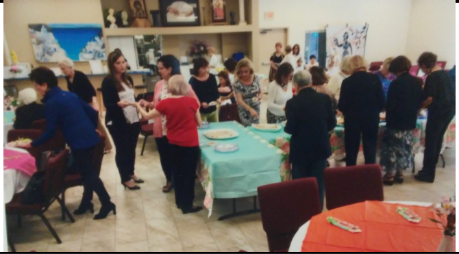
Nearly 50 women parishioners of St. George gathered for the annual Philoptochos Membership Luncheon at our parish hall on Saturday, March 9, 2019.