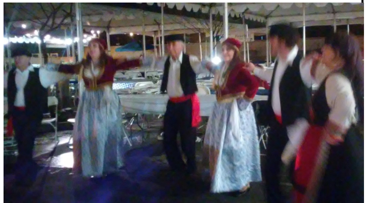
The Gypsy Dance Ensemble from L.A. performed at this year's Festival and "wowed" the crowd.