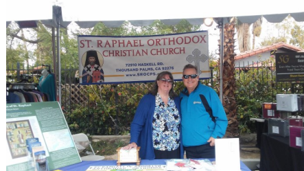
<---St. Raphael Antiochian Orthodox Church from Thousand Palms joined us.