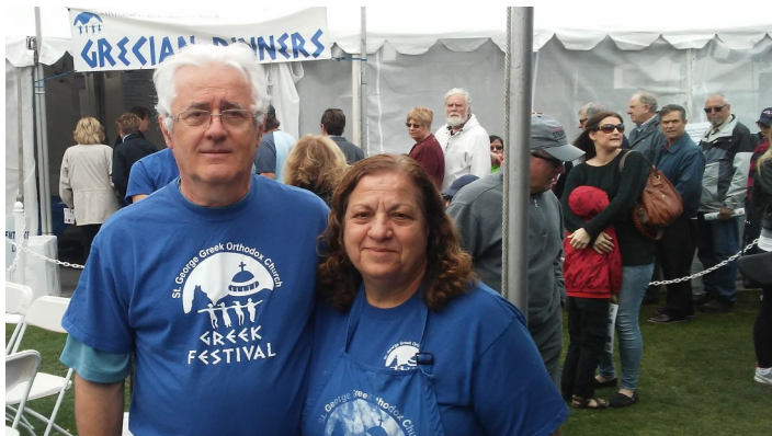
Festival Chairman, George Argyros and his wife, Anastasia