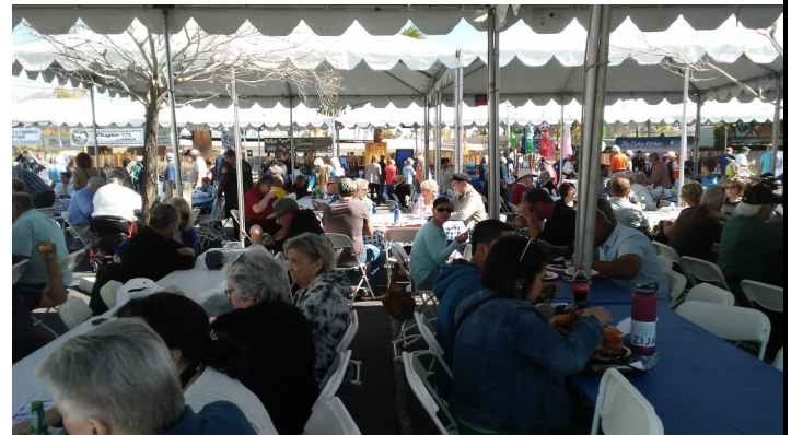
The crowd enjoyed our Festival immensely (until the rains came).