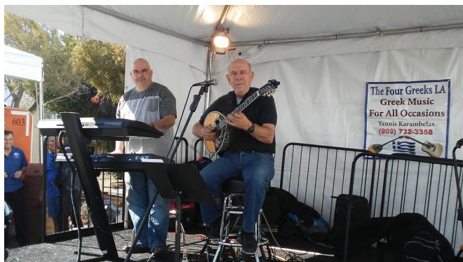
"The Greeks" entertained our Festival crowds as always!