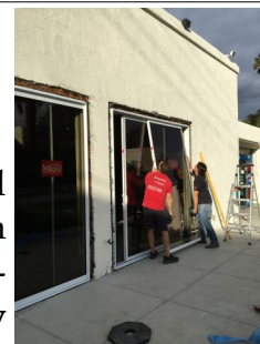
Above: workers install the new sliding doors connecting the parish hall to the courtyard.

In addition, the opening to the courtyard allows entrance and exit to the parish hall, which provides for the opportunity to rent the parish hall and courtyard separately or together for weddings, baptisms and other celebrations.