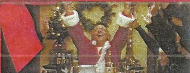
Telly - The Crazy Cousin