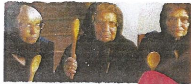
The Grandmothers - Yia Yia Mafia